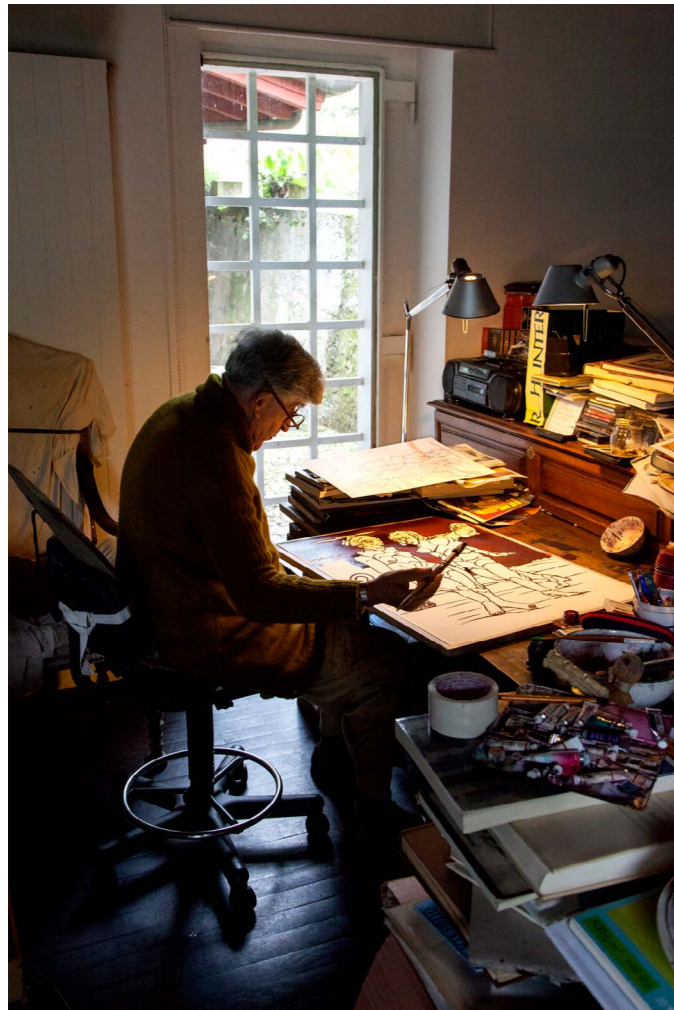
Studio di Meina \